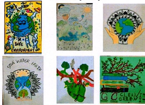
Poster Making- Handmade