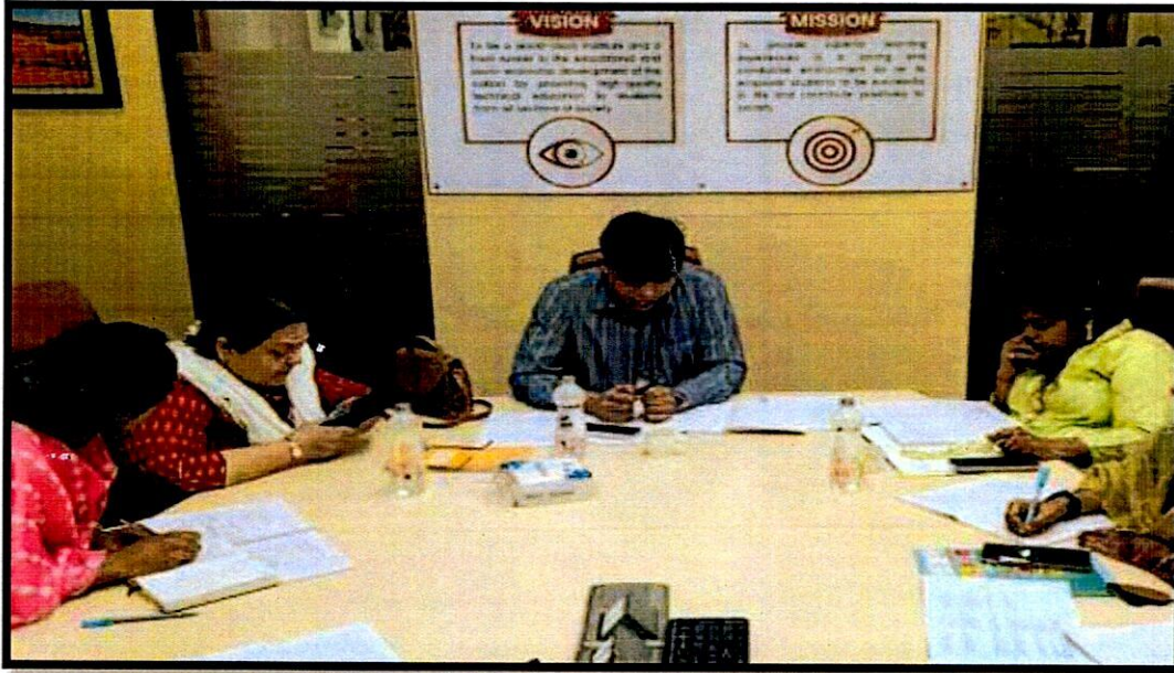
IQAC Coordinator discussing about the CO- PO Mapping